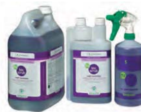
Nu-BioScrub™ Bathroom cleaner & descaler.