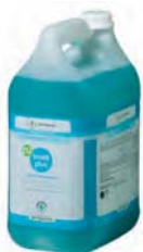
Nu-Smell Plus™ For acute odour problems.