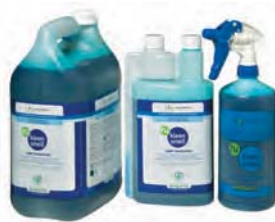
Nu-KleenSmell™ All hard surface cleaner